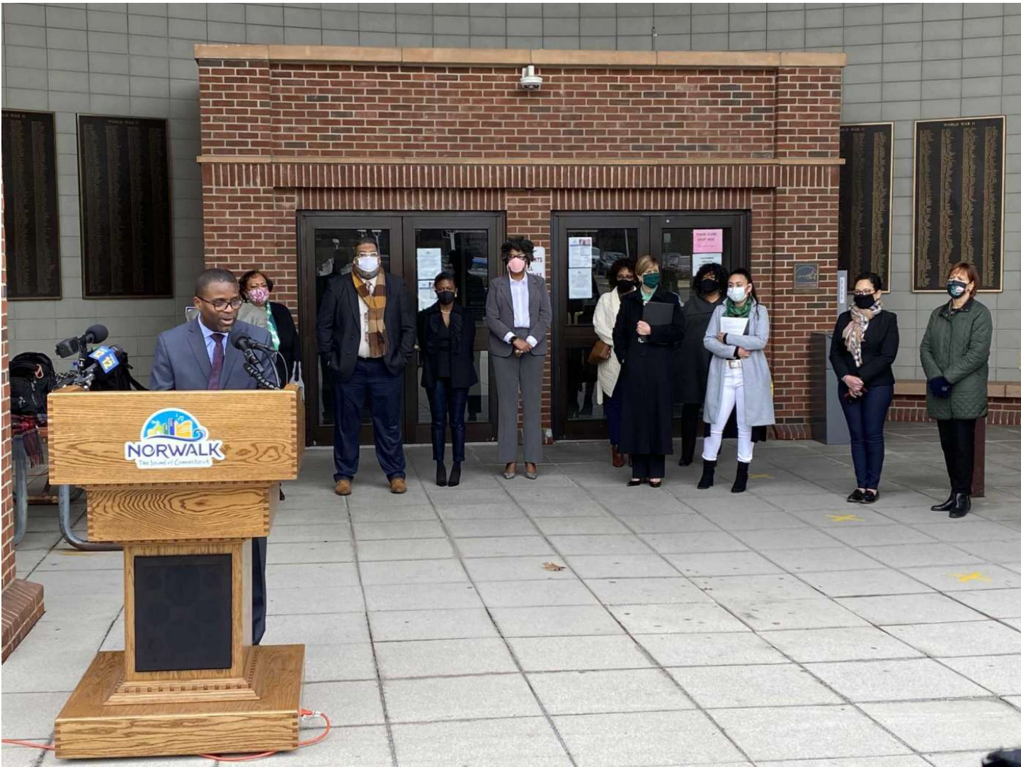
Norwalk Chief of Community Services addresses the crowd at a press conference outside city hall regarding the hiring of Led By Us & Associates consulting firm.

NORWALK – Bridgeport-based consultant firm Led By Us & Associates was chosen by the city as the consultant for the newly established Equity and Justice For All Commission, the city announced Wednesday.