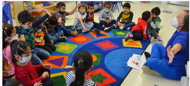
Through a grant from The Banyan Tree Fund, mothers can attend Mercy Learning Center's literacy and life skills classes while their children participate in early-childhood learning.